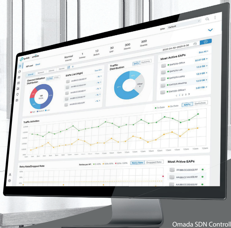
Omada SDN Controller